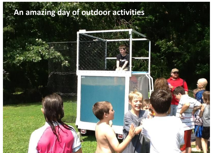
An amazing day of outdoor activities