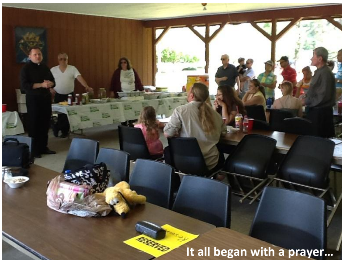
It all began with a prayer...

Quarterly meeting will be July 23 following the Council meeting.